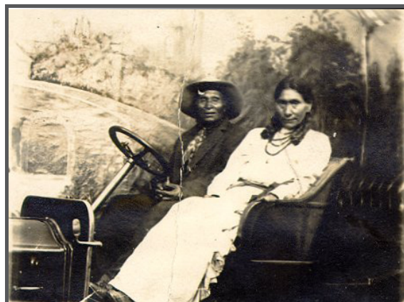
"Family in car"