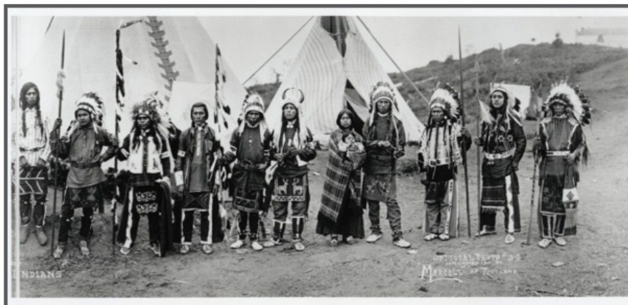
An official portrait of Yakima Indians near Astoria, Oregon in 1911. Library of Congress, (LC-USZ62-51284)