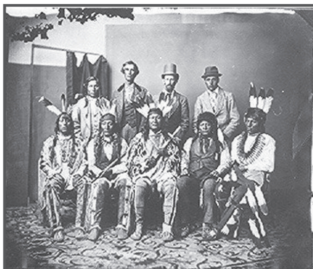
Mandan and Arikara delegation with escorts, 1874.