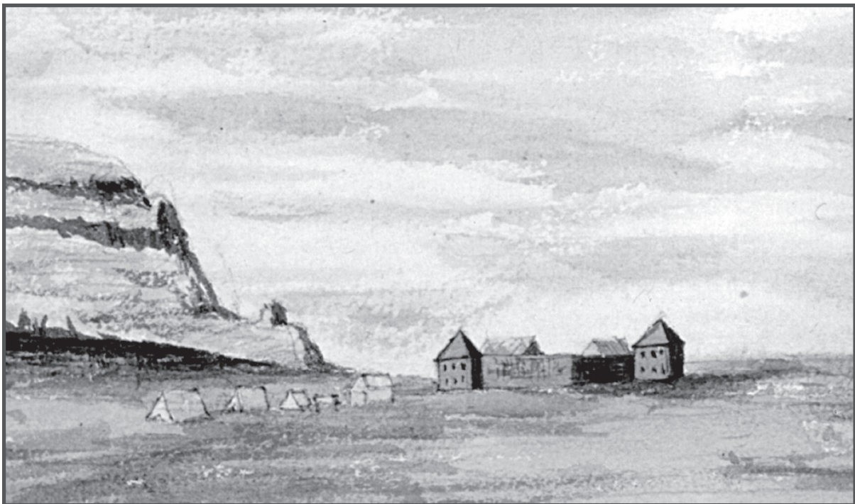
Old Ft. Walla Walla (partial of painting from Charles Wilson journal)