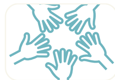
Partnerships & collaboration