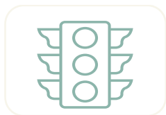
Access to education