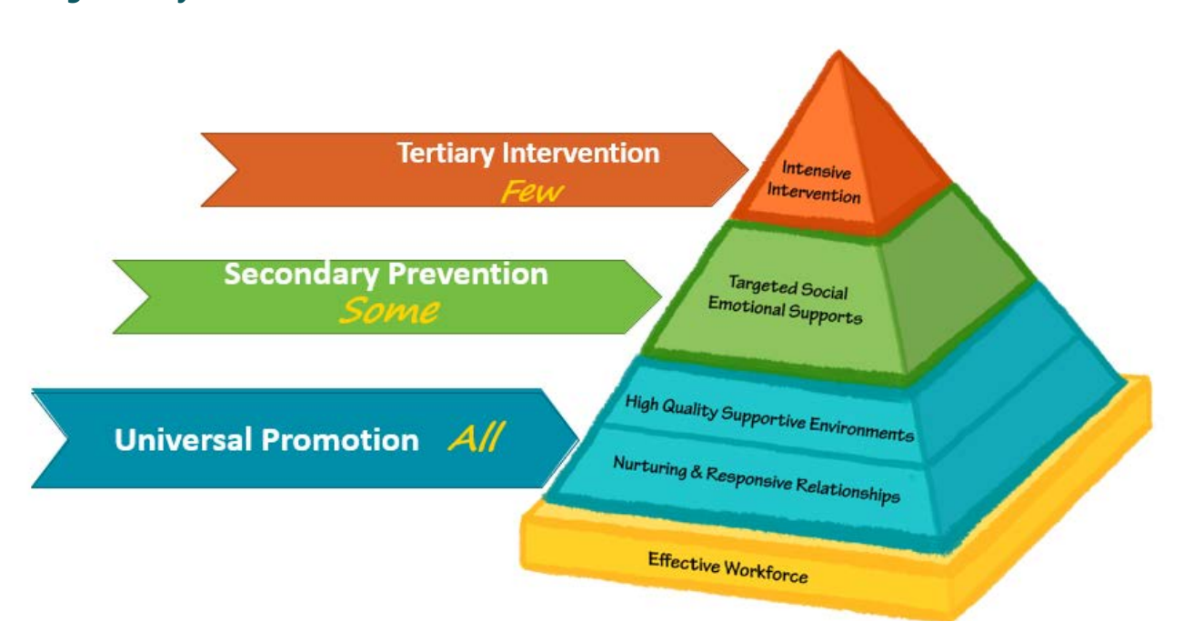
Figure 1: Pyramid Model Tiers

The Pyramid Model<sup>1</sup> is a national innovation for an equitable multi-leveled system of support to enhance social and emotional competence in infants, toddlers, and young children. Program-wide implementation of the Pyramid Model is often called <u>Early Childhood Positive</u> Behavioral Interventions and Supports (PBIS).