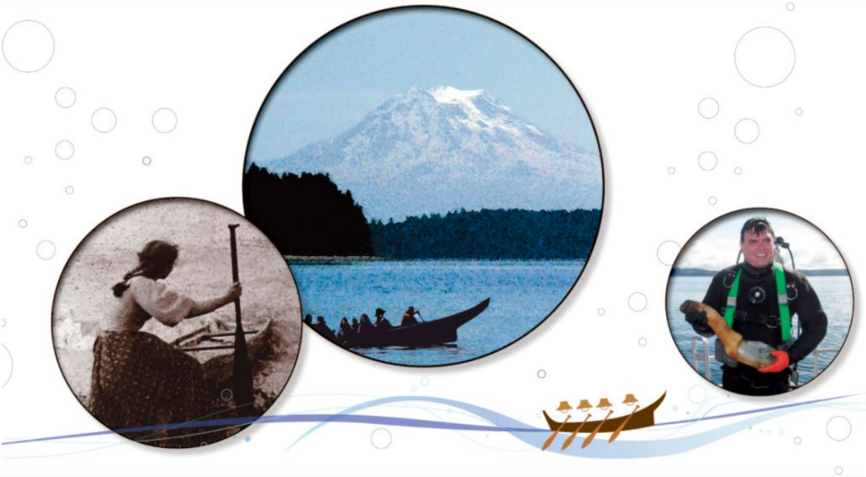
Squaxin Island Tribe – People of the Water