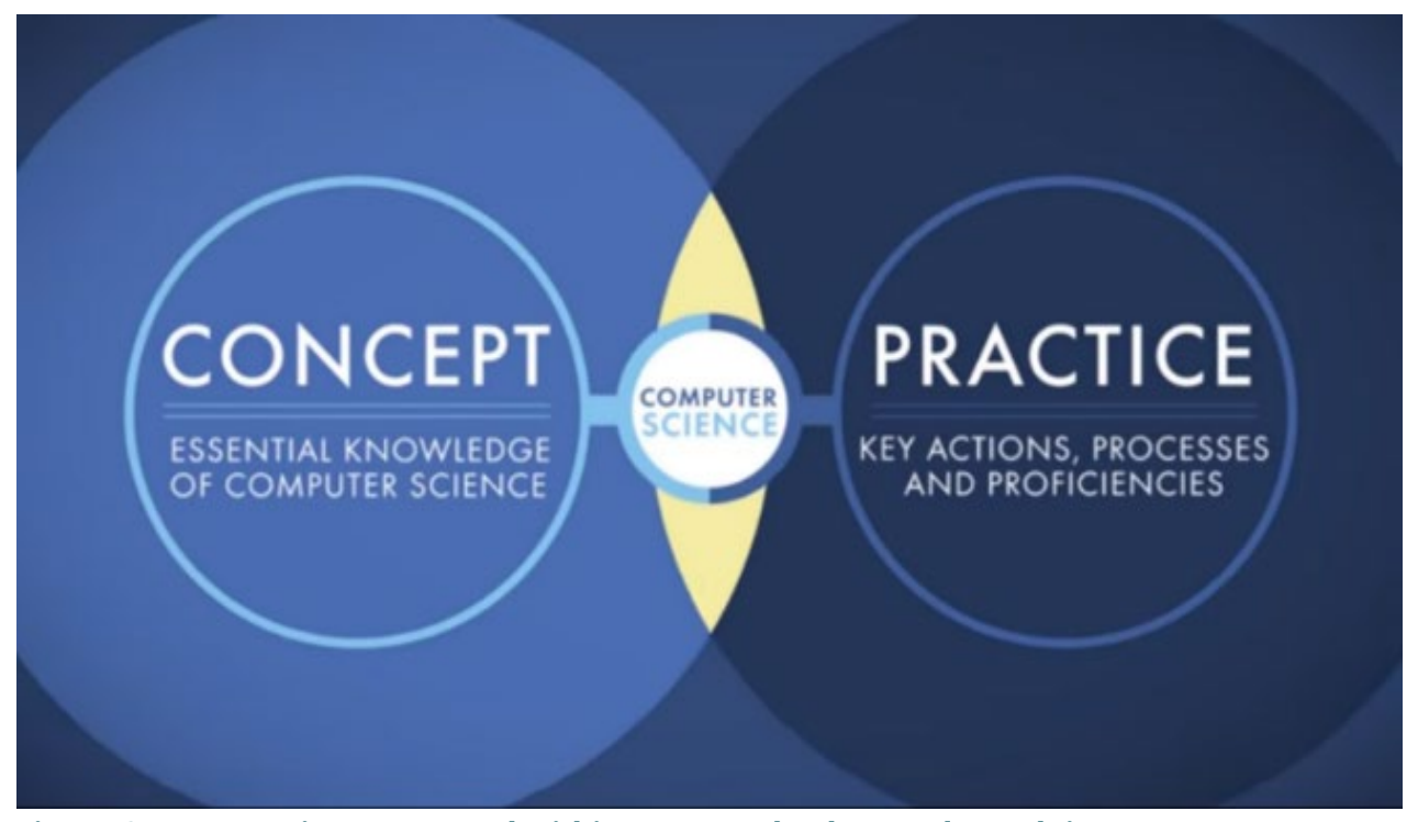
Figure 2: Key practices expressed within concepts lead to students doing computer science.

Many school districts are already teaching CS to a certain extent. Schools may already embed some aspects of foundational computer science content across multiple areas and courses. Examples of these areas and courses may include CTE technology courses, educational technology, digital citizenship, internet safety, and digital literacy. Computer science instruction does not need to occur in a standalone class with separate content, especially at the elementary level. Instead, computer science instruction may be a part of inter-related instruction taught within and across the examples of areas and courses.