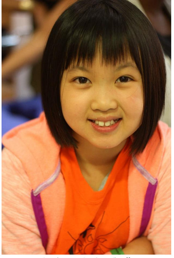
urce: Associated Recreation Council, Jefferson Community Center. (2016).

While many schools and districts use LAP funds for expanded learning, be sure to follow-up with state and district LAP administrators for further information and clarification on the restrictions and requirements involving LAP.