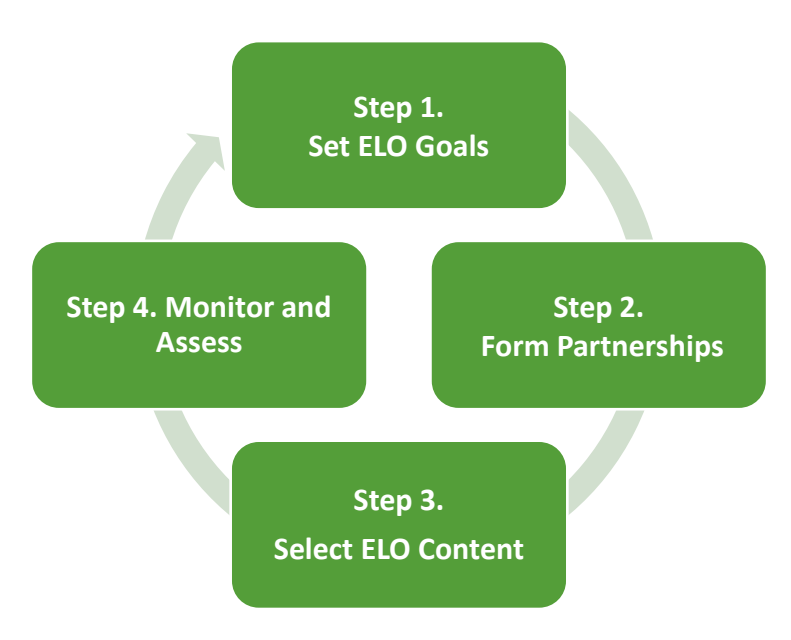
Step 1. Set Expanded Learning Opportunity Goals

Forming partnerships is critical if school districts want to increase the capacity and reach of their expanded learning opportunities. School districts can offer after-school programs and summer school programs by collaborating with community based organizations, park systems, libraries, businesses, and others in the community. These community partners bring unique learning opportunities, mentoring, cultural competencies, relationships, and other resources that strengthen the districts delivery of expanded learning opportunities. Moreover, community partners can potentially take the lead in delivery of ELO. This is particularly helpful for after-school settings, as schools and their staff are often overstretched during this time.