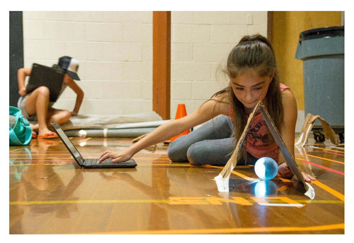
Source: White Salmon 21st Century Community Learning Center. (2017).

This four-step process should be cyclical: Based on the collaborative assessment of the district wide ELO system, goals may need to be redefined, partnerships may need to be tailored, and ELO content may need to change. It is important to note that communities, students, families, and partners should be involved throughout the process.