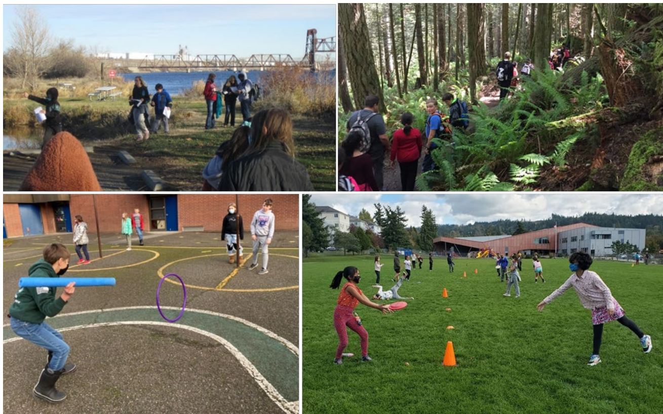
Students are engaged in learning in a variety of settings (photos used with permission)

The benefits included utilizing teachers from throughout Washington State. Each teacher that was asked to submit was excited to do so. The examples of what the lessons were and how to view the OER Hub were explained at a winter workshop for statewide Physical Education teachers. Exposing colleagues to OER Hub was helpful in showing a free resource available to teachers. Having specific example to show of physical education lessons was very valuable.