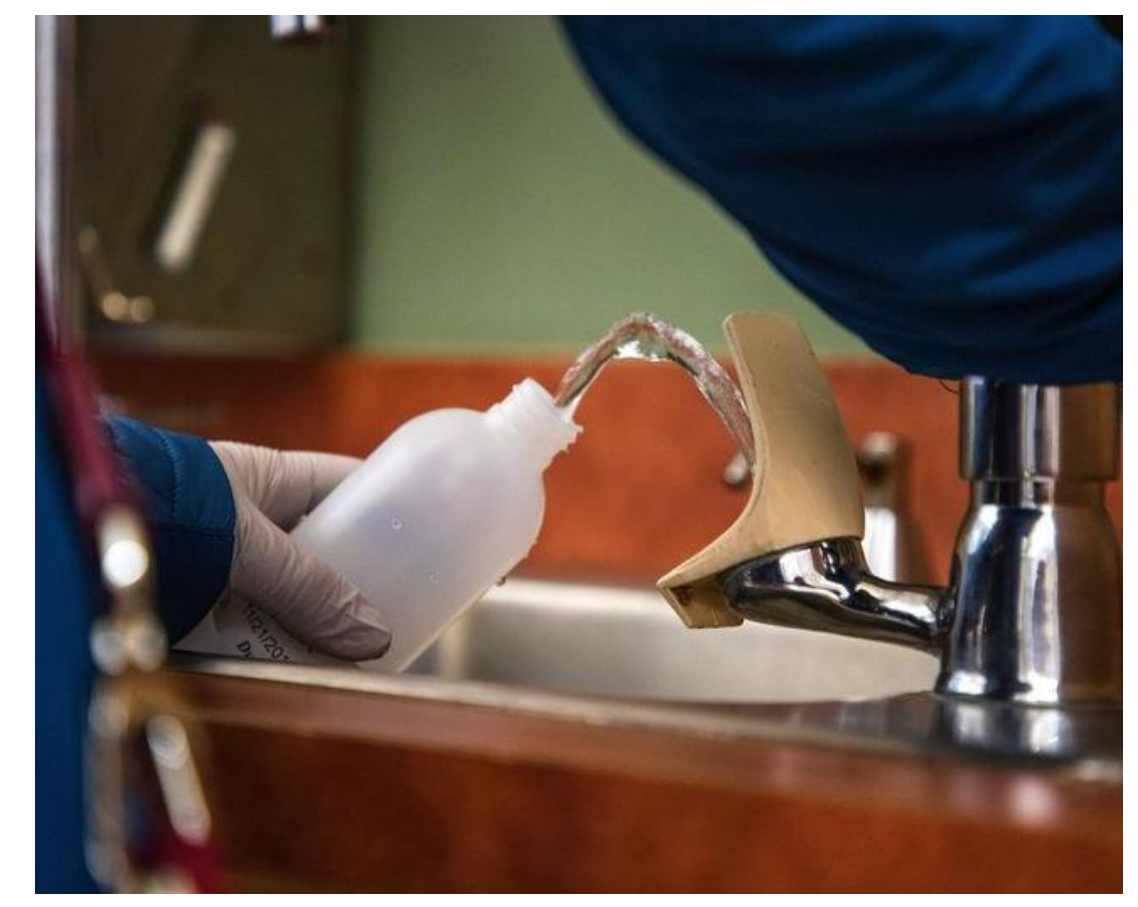
Siegal, M. (2019). A Seattle Public Schools administrator collects water for testing from a drinking fountain at Emerson Elementary School in South Seattle. The Seattle Times . Retrieved September 20, 2023, from https://www.seattletimes.com/.