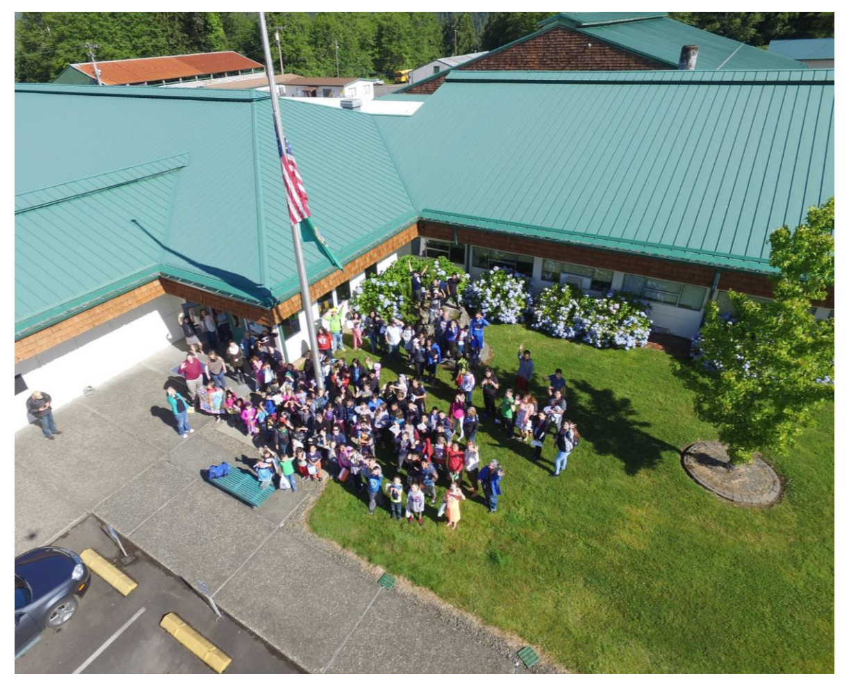
Lake Quinault K-12 School, Amanda Park.