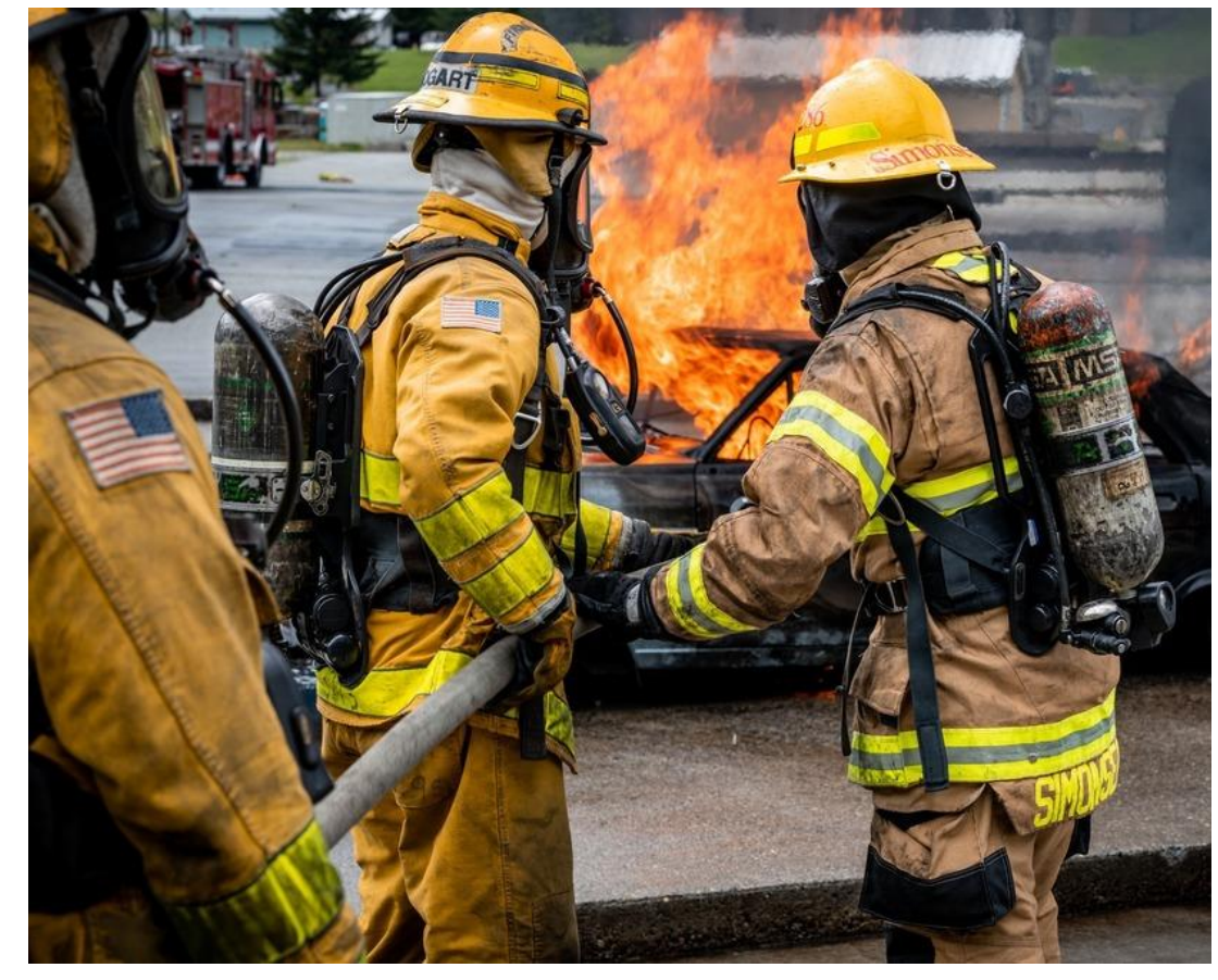
Northwest Career & Technical Academy fire science students.