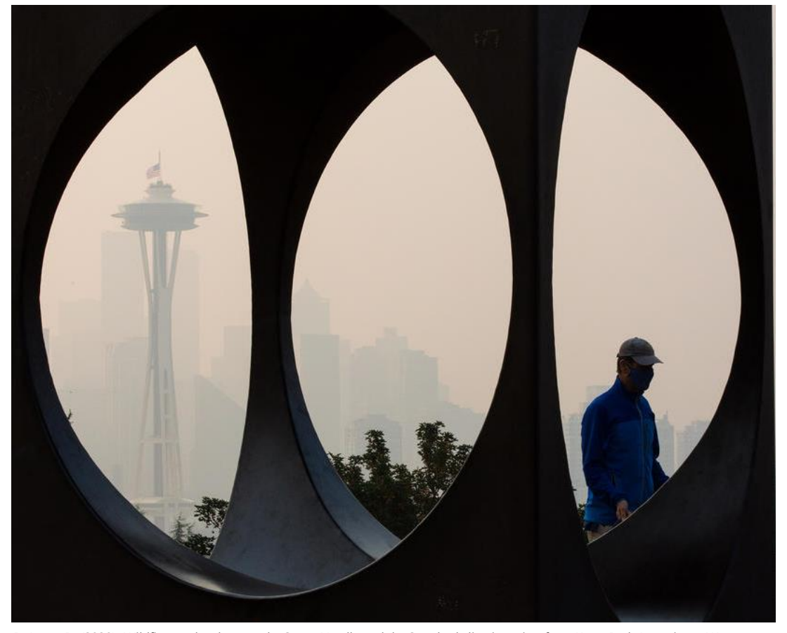
DeLong, D. (2020). Wildfire smoke obscures the Space Needle and the Seattle skyline in a view from Kerry Park. Investigate West Retrieved September 25, 2023, from https://www.invw.org/.