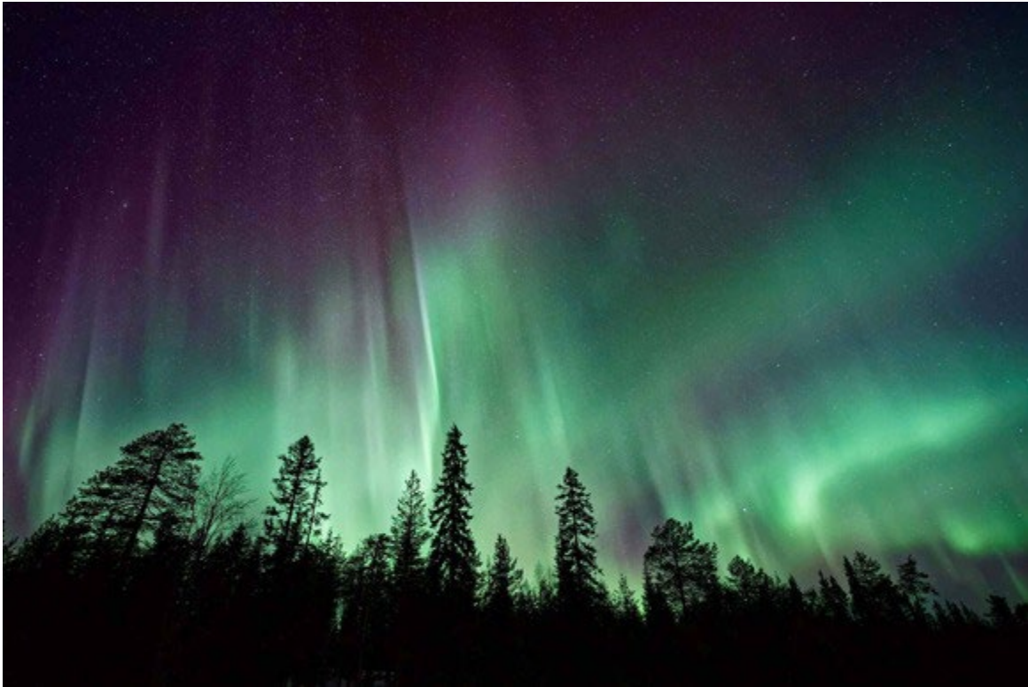
Photo of Aurora Borealis, also known as the Northern Lights, CC-BY Vincent Guth on Unsplash.