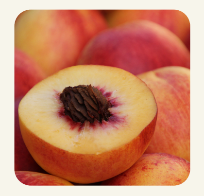
Peaches Week 6