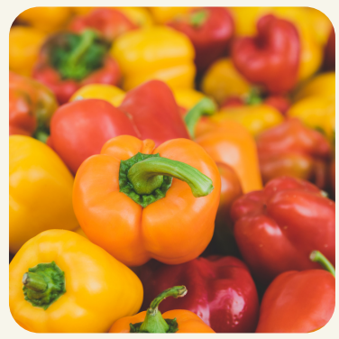
Peppers Week 8