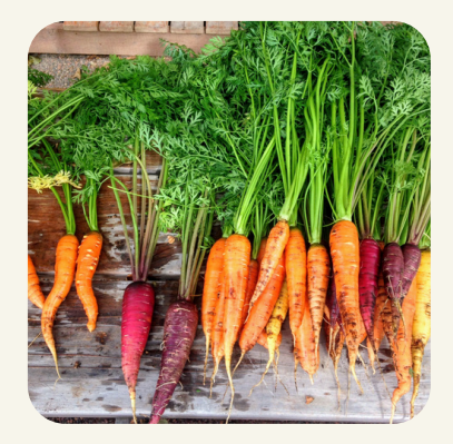
Carrots Week 1