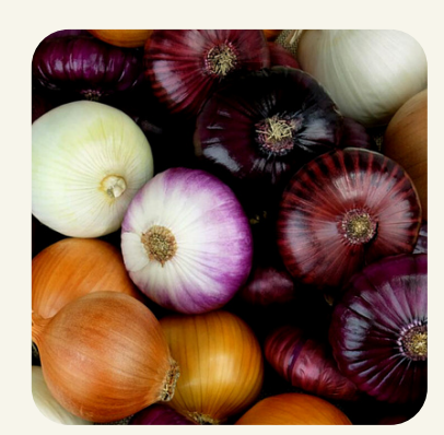
Onions Week 3