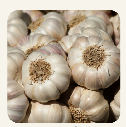
Garlic Week 7