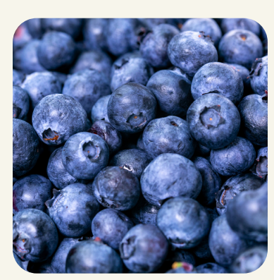
Blueberries Week 4