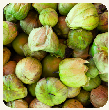
Tomatillos Week 9