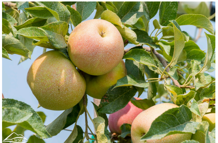
Apples in Walla Walla