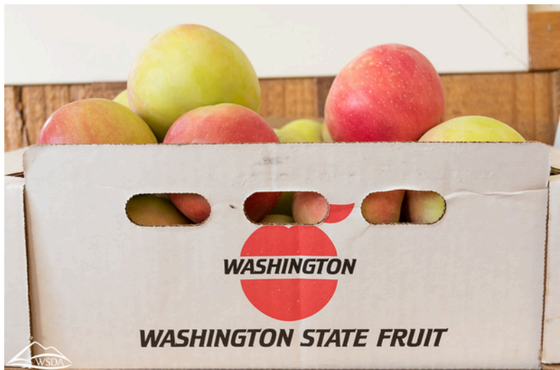
Apples in Grant County, credit: WSDA

This recipe was adapted from adapted from Harvest for Healthy Kids.