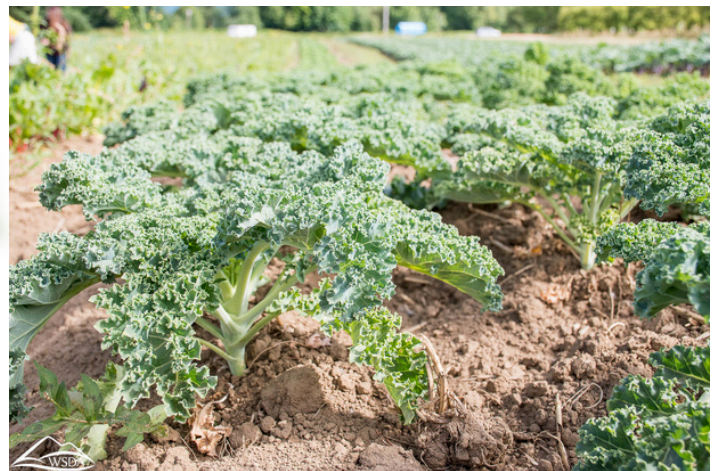
Curly green kale

Cabbage heads should be harvested whole when they are firm. They are ready when the outer leaf begins to fold back and they are the expected size for the variety.