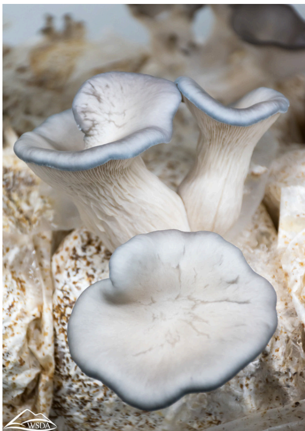
Mushroom cultivation