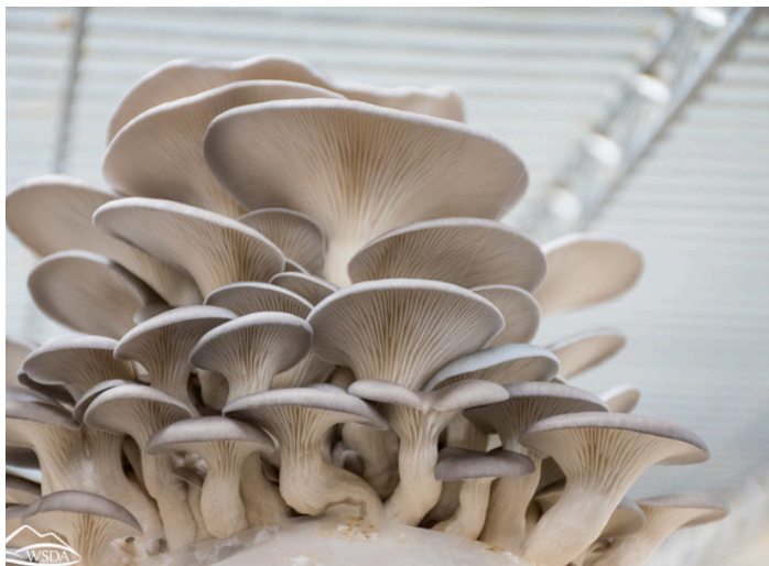
Mushroom cultivation