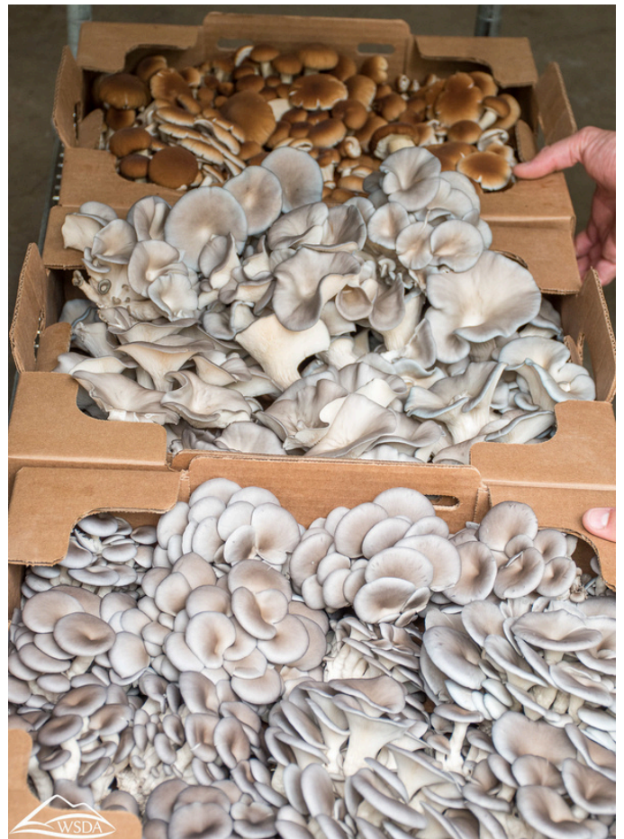
Mushroom cultivation

Each type of mushroom has its own growing needs. Some types, like oyster, shiitake, and lion's mane, can be grown in a classroom or school garden, while others, like morels and chanterelles, are difficult to grow outside of their natural environment. Many kinds of mushrooms can be grown by injecting mushroom spores into tree logs, straw, or sawdust. This process is called "inoculation." For a simpler and more reliable option, mushroom growing kits provide all the materials needed and step-by-step instructions.