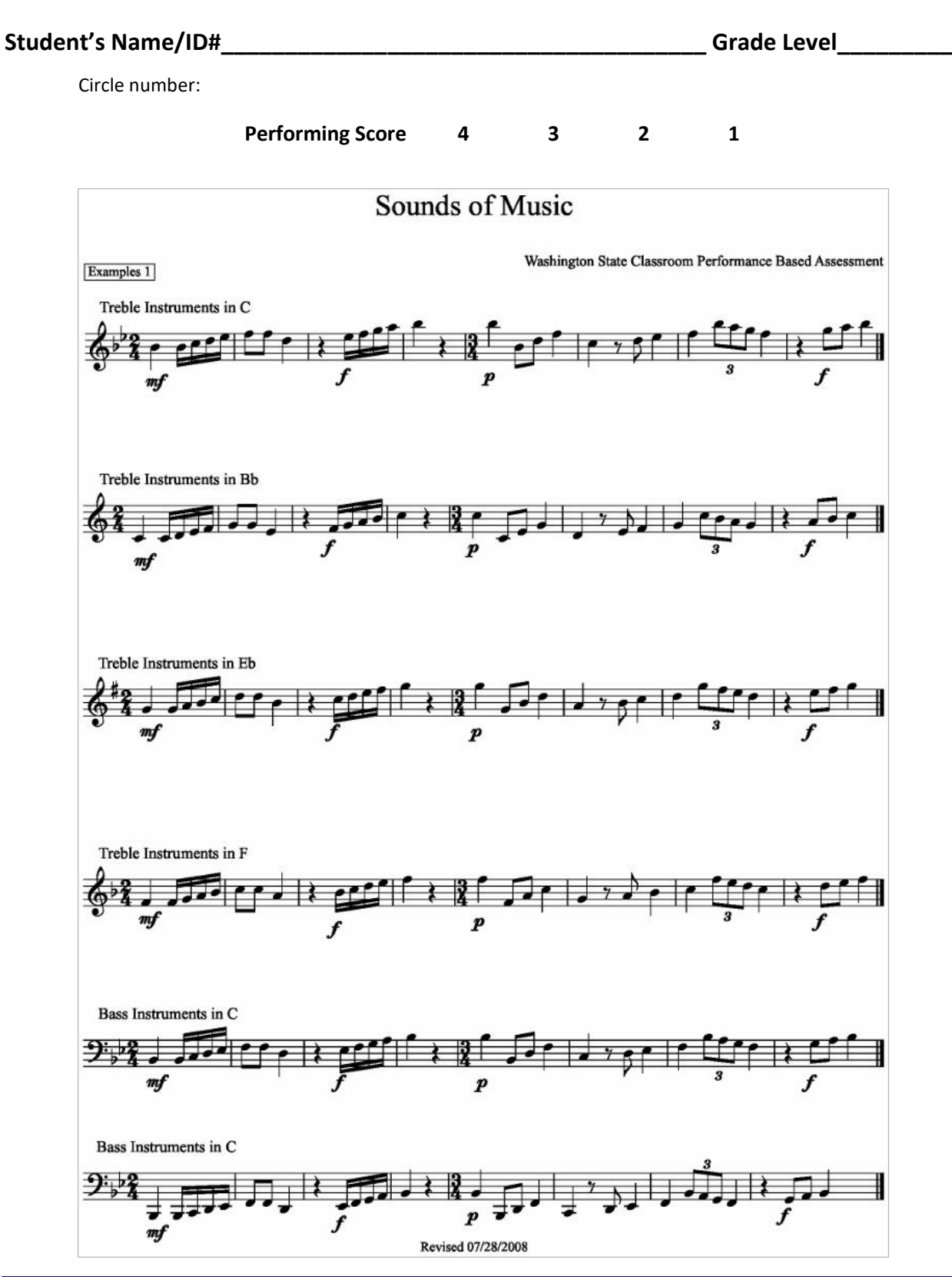
Sounds of Music: Arts Assessment for Music, High School Proficient | page 9