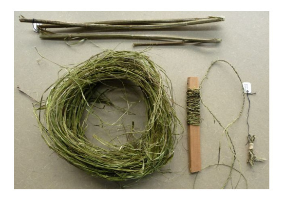
Nettle cordage and net

making cordage by using raffia or twine.