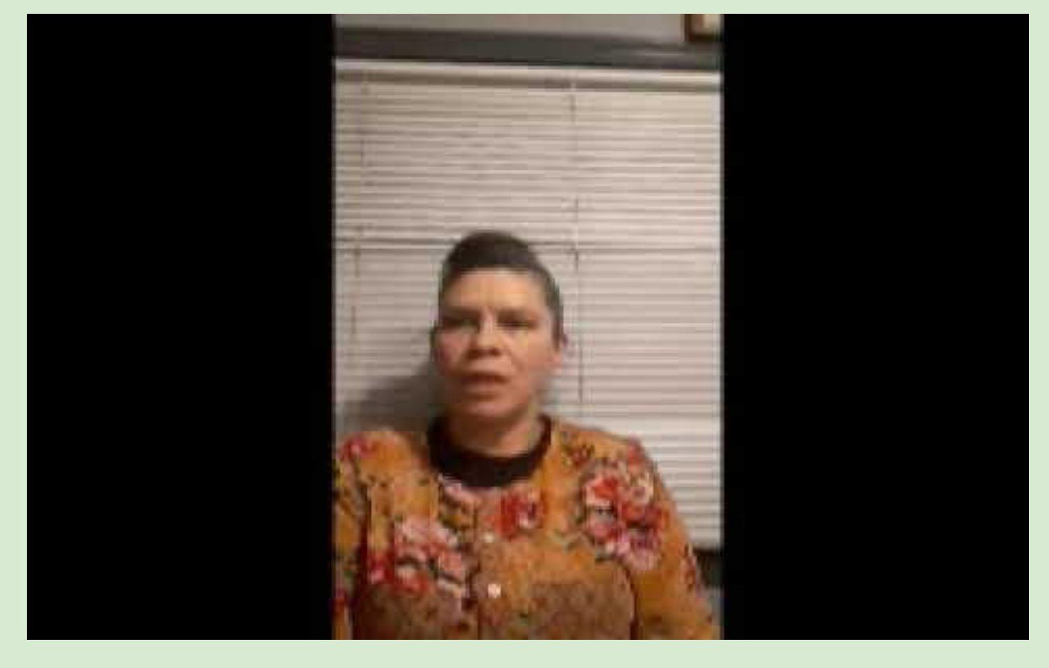
Sra. Covarrubias Class of 2019